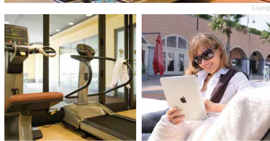
Technogym Fitness Area